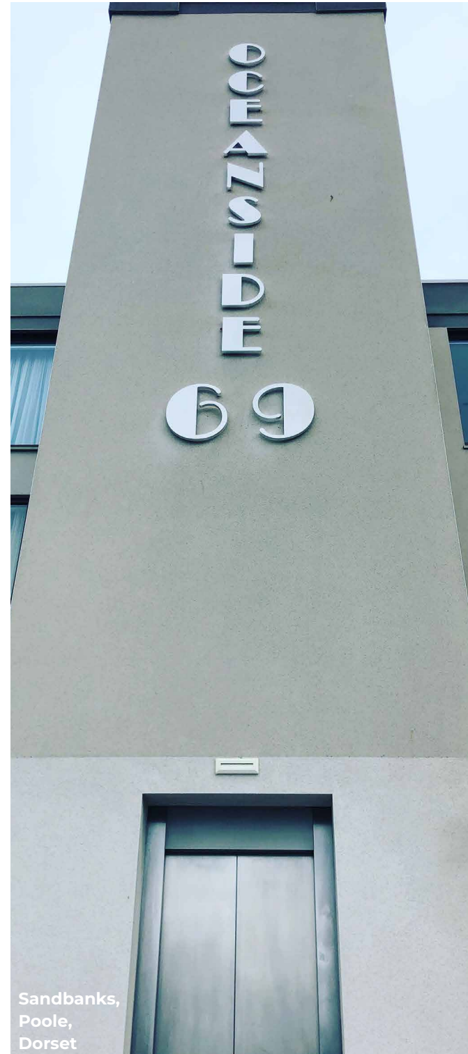
Sandbanks, Poole, Dorset