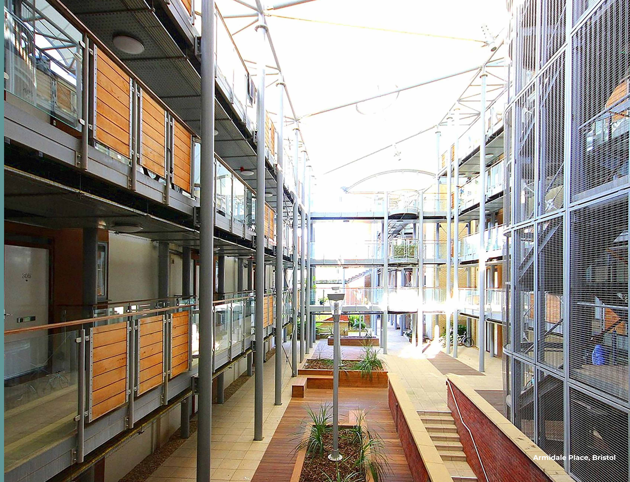
Armidale Place, Bristol

ISE supplies accredited engineer surveyors that meet the independent competent person requirements.