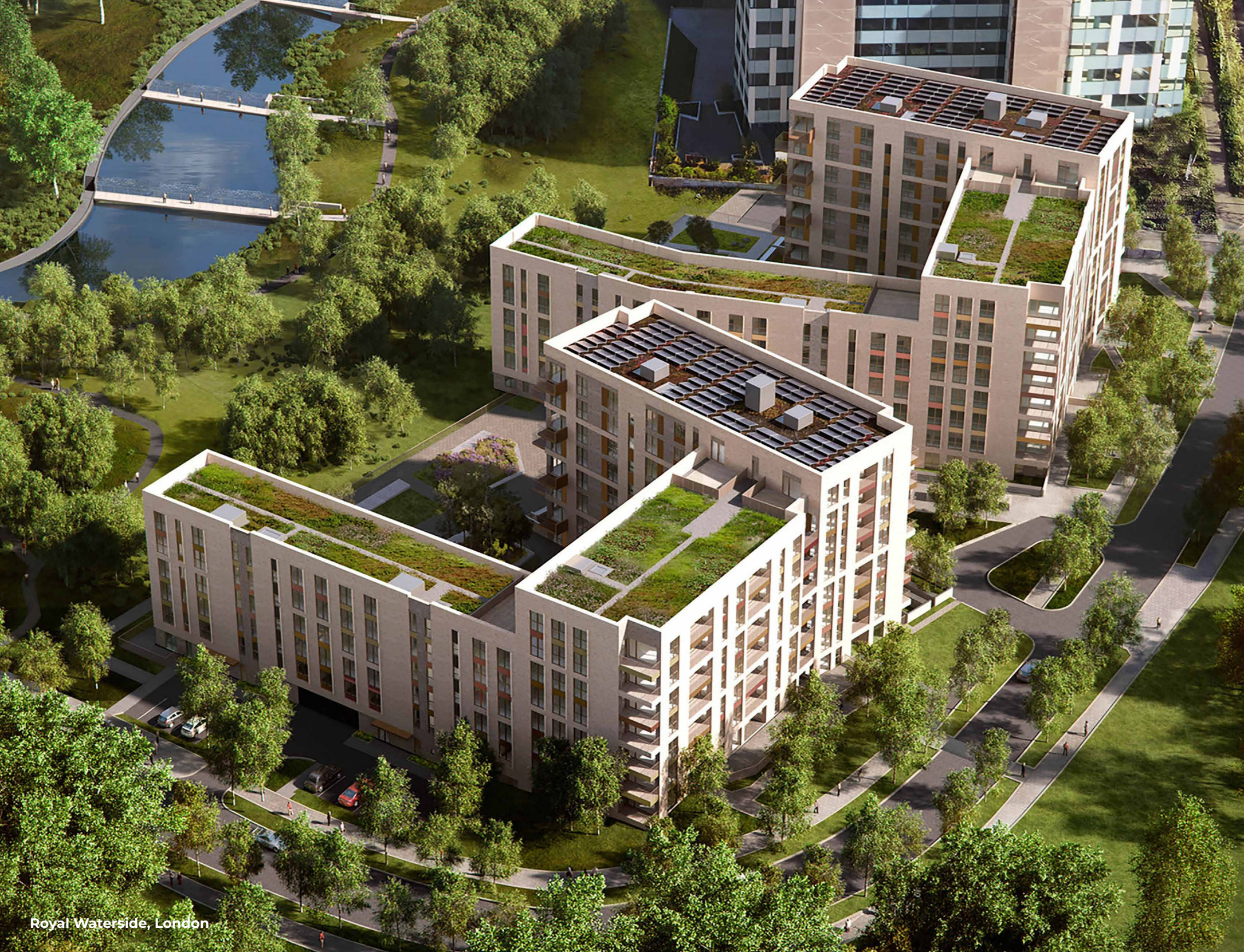
Royal Waterside, London

Engineering expertise dedicated to ensuring lifts in residential property management settings are LOLER compliant and safe